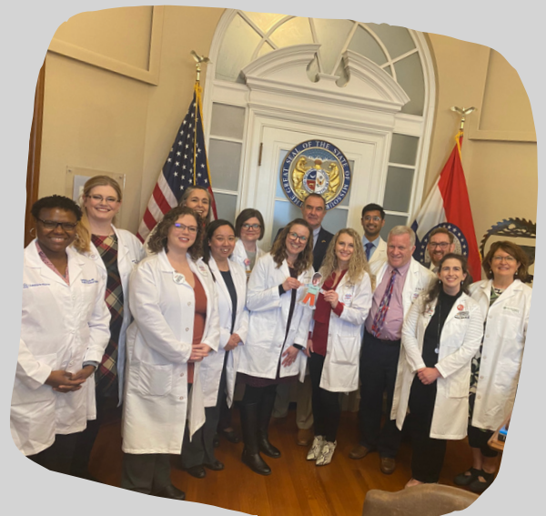
MEMBERS OF THE MOAAP BOARD PHOTOGRAPHED WITH MISSOURI LT. GOVERNOR MIKE KEHOE