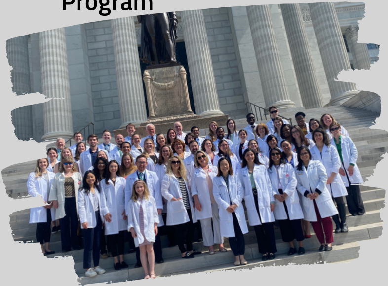
MEMBERS OF MOAAP POSE ON THE STATE CAPITOL STEPS ON ADVOCACY DAY